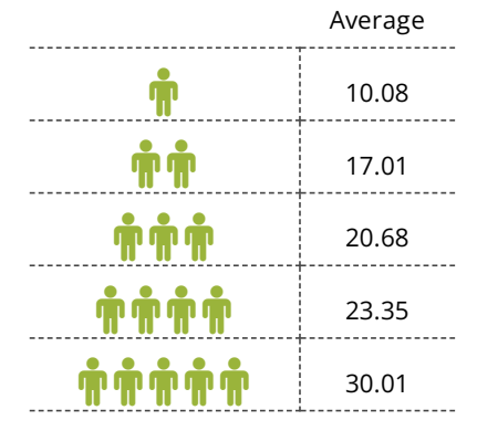
Average daily usage (kWh): 6.30 You use the same as a 1 person household.